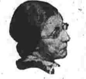
Judith Anderson and Dorothy Stickney star in the delightful story of two stubborn Glastonbury spinners who stage America's most charming rebellion on